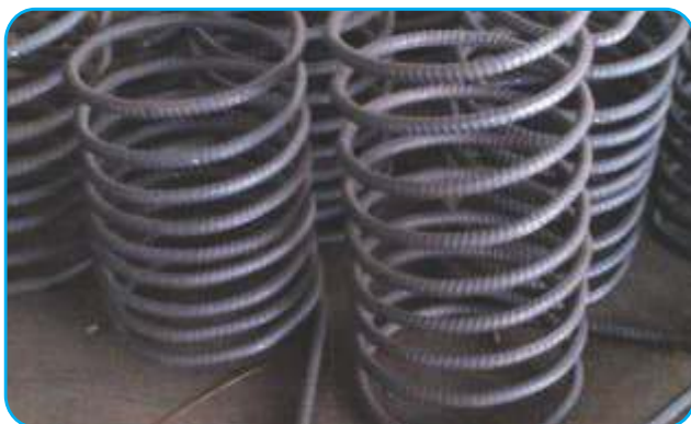
Helical or Spring